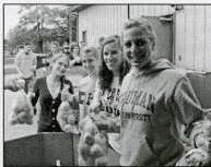
Truman students form an assembly line to help unload a truck of donations to the Salvation Army food pantry.