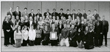
Members of the Truman (Iota Nu) chapter of Delta Sigma Pi display the Most Outstanding Chapter award. Truman's chapter has now received the award nine times.

order to represent Truman effectively. The chapter was founded Dec. 9, 1978. Since then, it has claimed the National Most Outstanding Chapter Award nine times, which is more than any other chapter. The International Fraternity of Delta Sigma Pi was founded at New York University, School of Commerce, Accounts and Finance Nov. 7, 1907.