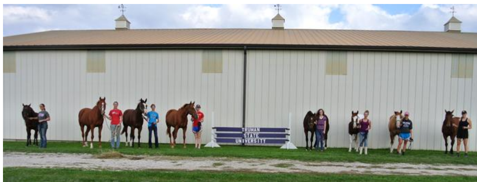
Horses pictured from left to right: Mouse, Quick, Atticus, AJ, Goldie, Gypsy, Etta and Reno.

Students are encouraged to help celebrate Tag Day Nov. 15 by stopping by the table in the Student Union Building and writing a thank you note to a Truman donor.