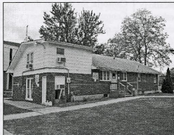
Department of Public Safety Building

fall. The south side will be closed for renovation during 2010-2011 school year. Over the summer, the Ryle Hall kitchen will be completely replaced and the dining hall and lobby will be refurbished.