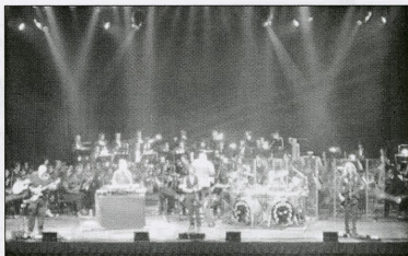
The Truman Orchestra performs with Kansas in St. Charles, Mo., Oct. 9.

Bulen also hopes the University's new contacts with D'Addario will provide students