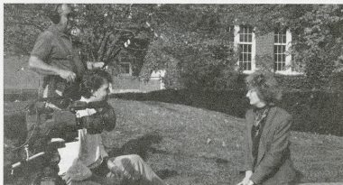
A camera crew films a commercial opposing Amendment 7 on campus Oct. 13. The commercial is funded by the Committee to Protect Missouri's Future and will run statewide. ☛