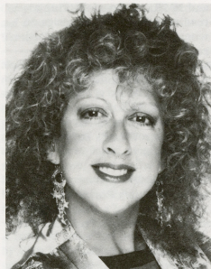
Elaine Boosler is the featured attraction Saturday night.

Registration forms may be picked up and turned in at the Student Activities Office.