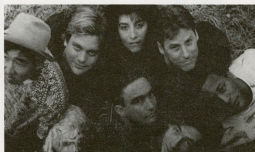
Friday night SAB presents Poi Dog Pondering in Baldwin Auditorium.