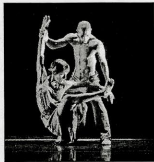
Hubbard Street 2

For more information go online to http://lyceum.truman.edu .