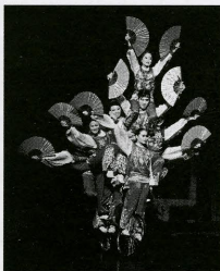
Golden Dragon Acrobats

Lyceum events, contact the Public Relations Office at 785.4016.