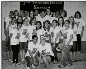
Truman nursing students pose with their nursing buddies from West Visayas State University in Iloilo City, Philippines.

These individuals will present a program entitled "Transcultural Experience in the Philippines" at 7 p.m. Sept. 28 in the Student Union Building Activities Room. The event is open to the public and refreshments will be served.