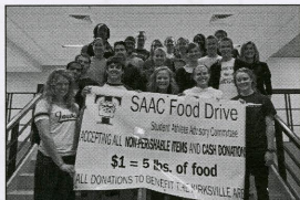
The Student Athlete Advisory Committee (SAAC) has surpassed last year's food drive collection by 500 lbs. Shown is SAAC with a poster for their annual food drive.

SAAC will resume the food drive next semester with collections at men's and women's basketball, softball, baseball and other spring sport events. All donations will be split between the Kirksville Salvation Army and the Christian Community Food Depot.