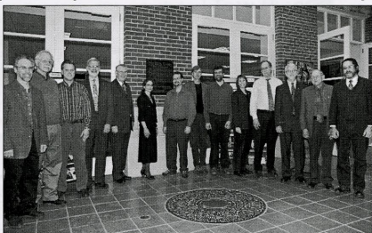
Attendees pose for a photo after the installation of the Phi Beta Kappa plaque in Pickler Memorial Library. Truman is only the second public Missouri university to have received a Phi Beta Kappa charter.

Membership in Phi Beta Kappa shows commitment to the liberal arts and sciences, and to freedom of inquiry and expression — and it provides a competitive edge in the marketplace.