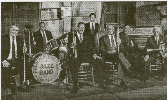
Veteran members of the Preservation Hall Jazz Band will entertain on the Baldwin Auditorium stage at 7:30 p.m., Sept. 27, as they kick off the 2000-2001 Kohlenberg Lyceum Series. Tickets will be available Sept. 20 in the SAB Office.

The Clothesline Project will be on display all week, 8 a.m.-5 p.m., SUB Mall