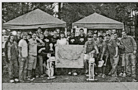
Pi Kappa Phi members gather near the stationary bikes where students rode recently on the Quadrangle to raise awareness of accessibility for the disabled.