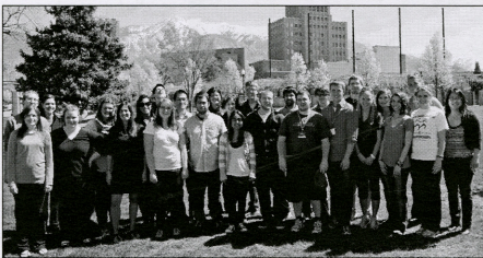
Twenty-seven Truman students travelled to Ogden, Utah to showcase their undergraduate research across all disciplines at the National Conference on Undergraduate Research.

of Student Research but also by the School of Science and Mathematics, the Biology Department, the Health and Exercise Sciences Department, the Economics Department and the Phi Kappa Phi honors society.