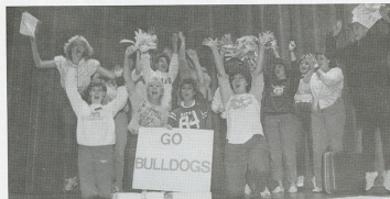
Members of the Alpha Sigma Gamma service sorority end their pep-rally skit with a cheer for the football Bulldogs at the skit tryouts in Baldwin Auditorium, Sept. 29. They performed their skit at the pep rally, Oct. 3, along with Blanton-Nason residence hall members and Sigma Sigma Sigma and Alpha Sigma Alpha social sororities.