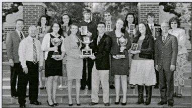
Speech and Debate Team members brought home several awards after the National Forensics Association Championship Tournament in Athens, Ohio.