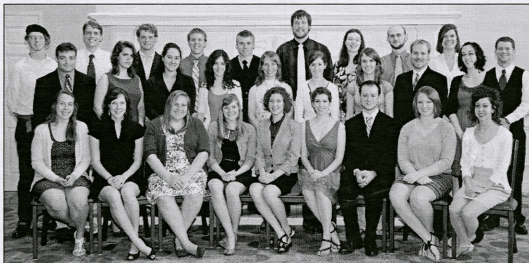
Phi Beta Kappa's newest members pose in the Student Union Building for their induction April 15.