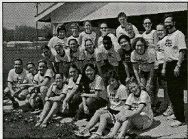
The Milan Volunteers

For several weeks, these bilingual college students have been assisting with the Tuesday and Thursday evening English classes. April 17, Milan Volunteers sponsored a picnic at the American Legion Park in Milan for Latino children and their parents. Mexican dishes were donated by El Vaquero Mexican Restaurant, La Pachanga, and Latino residents from Milan. The college students