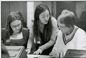
Members of Beta Alpha Psi help an area resident file her taxes during a recent VITA workshop. The sessions are designed to help members of the community file their simple returns for free.