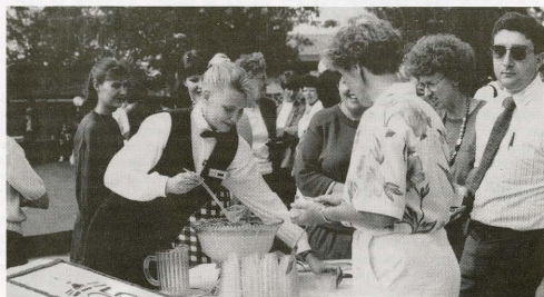
Students, faculty and staff line up for refreshments Sept. 2 at the celebration of the 125th anniversary of the first day of classes. Approximately 400 people attended.

Free tickets for students, faculty and staff will be available beginning Sept. 16 in the Student Activities Board Office, SUB.