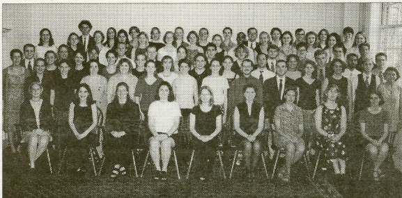
Pictured above are the more than 80 students who were initiated into Truman's chapter of Phi Beta Kappa on April 22. They represent the first student members of the honor society on this campus.