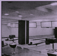
Removed in 1991 and located on the lower level of the Student Union, the bowling lanes were originally replaced with a games area.