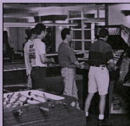
The Games Room, as it was known at the time, resided in the present-day location of a number of offices including the Center for Student Involvement, Student Senate and the Student Activities Board.