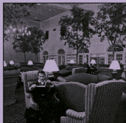
The Quiet Lounge was renovated in 2006 and renamed the HUB in 2008 to better reflect the new use for the area which is now a popular hangout for students to eat, meet for study groups or just hang out with friends.