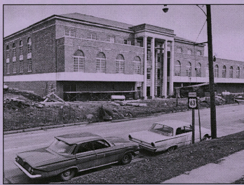
A view of the west side of the Student Union Building from Franklin Street, circa 1966.

1986- The first phase of the renovation begins with the relocation of student media offices including the Index,