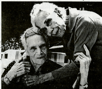
Sarah "Sadie" Delany and A. Elizabeth "Bessie" Delany are the subjects of the Tony-nominated play, Having Our Say and authors of the bestselling autobiography, Having Our Say: The Delany Sisters' First 100 Years . The play will be presented by the Lyceum Series on Oct. 23 at 7:30 p.m. in Baldwin Auditorium.

The two sisters never married and lived much of their life together in Harlem. During their centennial years, they lived in Mount Vernon, N.Y., where Sadie still resides today. Bessie died in their home on Sept. 25, 1995, but