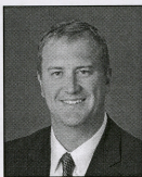
Senator Eric S. Schmitt

His public service includes serving as a Glendale, Mo., alderman from 2005-2008. He has also served on boards for DeSmet