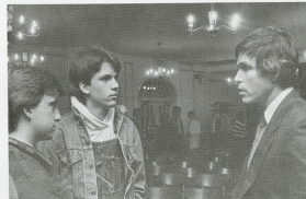
Dr. Robert Jarvik, inventor of the Jarvik 7 artificial heart, signed autographs for and spoke with students at vos Savant's lecture. Jarvik accompanied vos Savant on her visit to Kirksville.

Due to the Thanksgiving holiday, entry deadline for the Northeast Today is 5 p.m. today. (Entry deadline for following issues will return to 5 p.m. the Wednesday prior to Monday's issue.) Entry forms are available in the Public Relations Office, A/H 202.