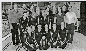
The Truman women's swimming team gathers after winning the NCAA Division II Swimming and Diving Championships March 15 in Columbia, Mo.

had two. The Truman men scored 48 points and finished in 20th place overall.