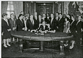
Gov. Mel Carnahan signs the official legislation changing the University's name to Truman in 1995.

"Ten years ago this month, Northeast received a new statewide mission as Missouri's liberal arts and sciences university," Carnahan said in 1995. "Since that time, the University's success