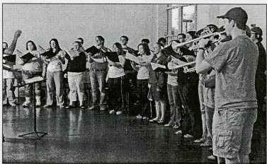
Cantoria and Brass Ensemble members practice prior to leaving for their two-week tour of Italy and Greece.